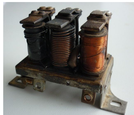
Overheated Siba 3 bobbin controller