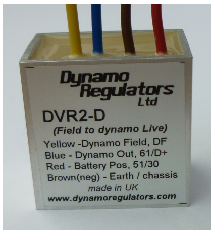
DVR2-D for Dynastarts

DRL has made every effort to ensure a robust and reliable design, using up to date components assembled using dependable 'surface mount' technology. Housed in a neat aluminium case. Compact size, electrically rugged and fault tolerant, with superior heat transfer to keep the circuitry cool for enhanced reliability.