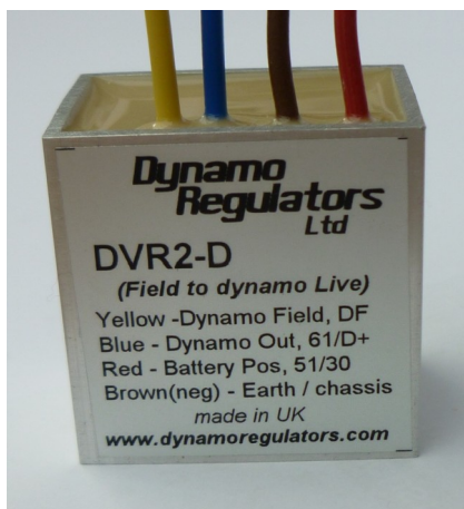
DVR2-D for Dynastarts

DRL has made every effort to ensure a robust and reliable design, using up to date components assembled using dependable 'surface mount' technology. Housed in a neat aluminium case. Compact size, electrically rugged and fault tolerant, with superior heat transfer to keep the circuitry cool for enhanced reliability.